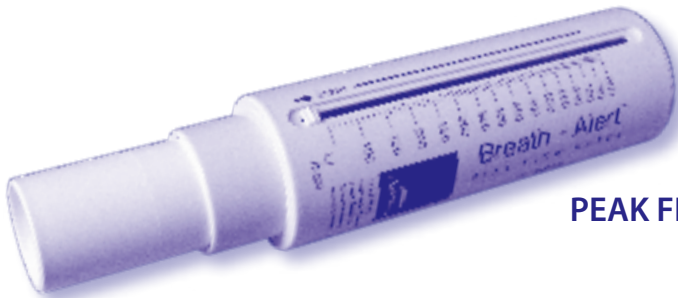
PEAK FLOW METER